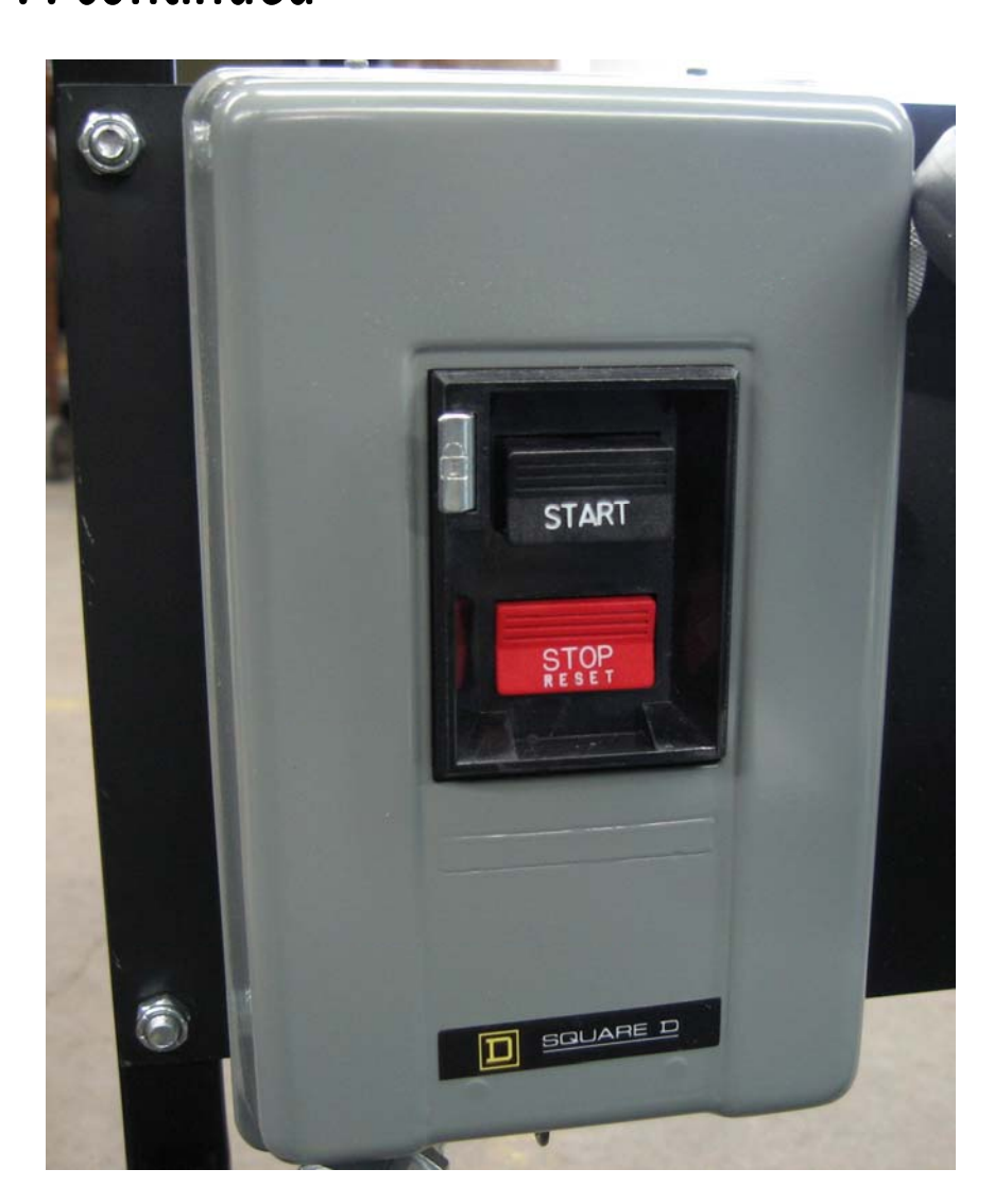
Motor Start/Stop Switch